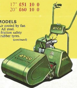
12", 14", 17" and 20" Models