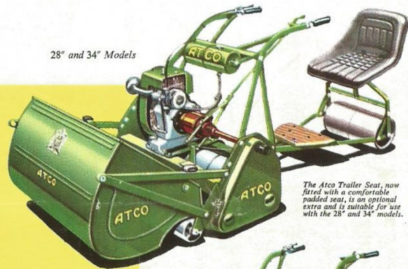
The Atco Trailer Seat, now fitted with a comfortable padded seat, is an optional extra and is suitable for use with the 28" and 34" models.