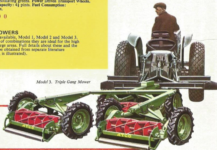
Model 3. Triple Gang Mower

Separate and more detailed literature is available upon request for these Atcos and also for the 20" Heavy Duty Sicewheel model, 84" fully-powered Triple and Atco Gang Mowers.